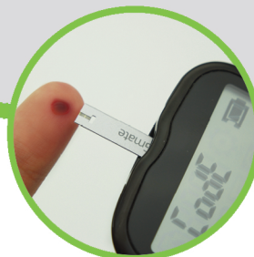
Apply the sample