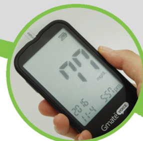
Test result will be shown in 5 seconds (with audio guidance)