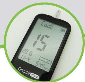
Insert Gmate ® Test Strip