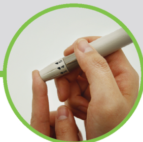
Collect blood sample